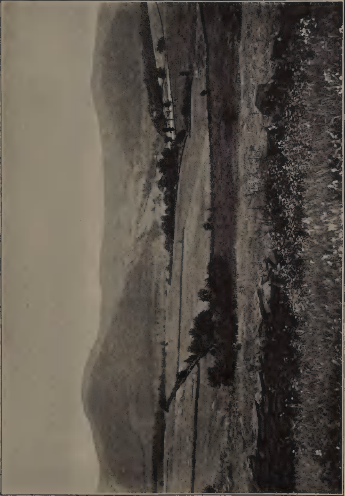
VIEW OF THE CATSKILLS FROM WOODCHUCK LODGE